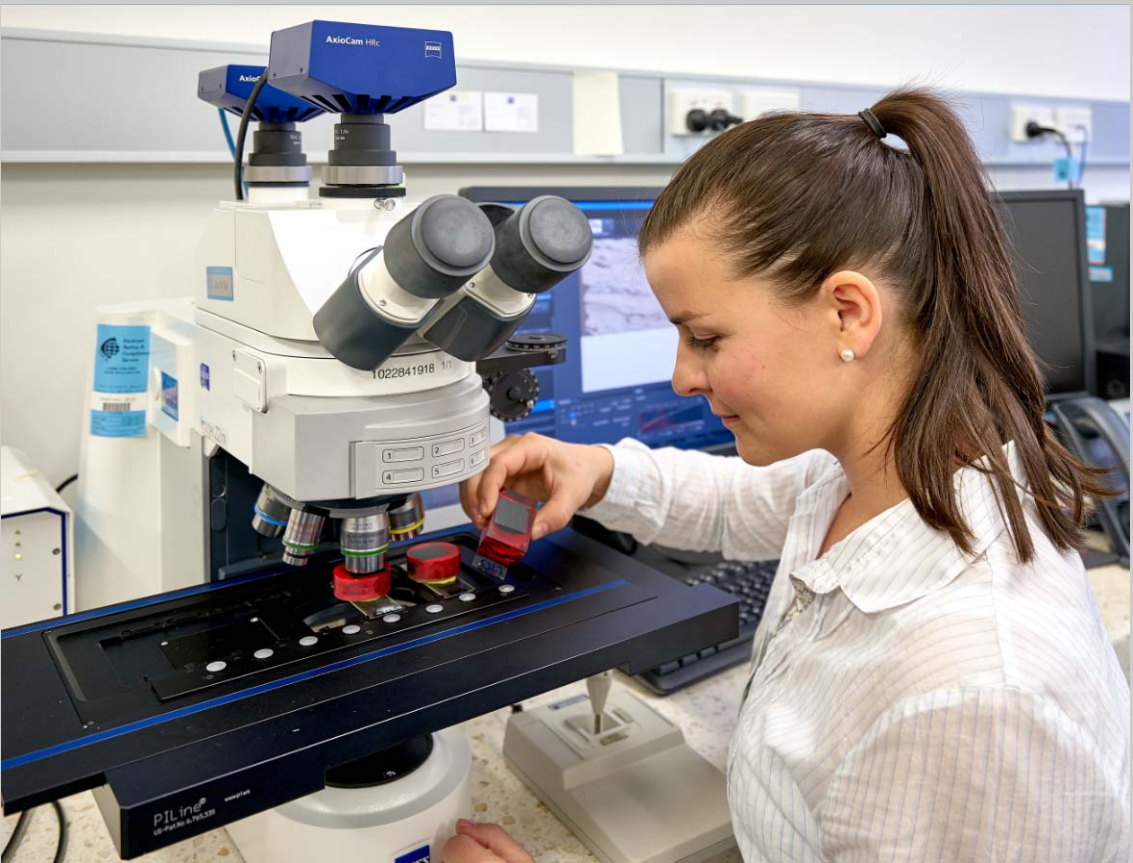
Placing samples on the microscope stage